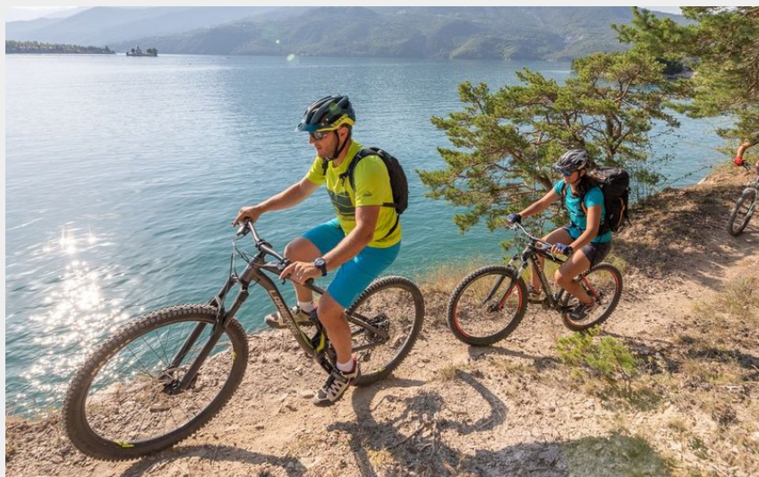
VTT Baie St-Michel (Parc national des Ecrins - Thibaut Blais)