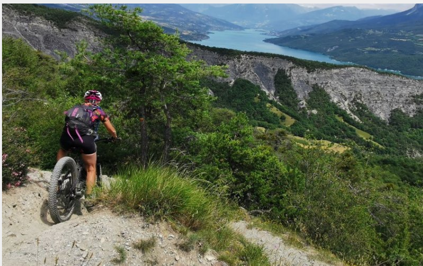
Descente sur le lac - sentier monotrace (Parc national Ecrins - E-Pedal)