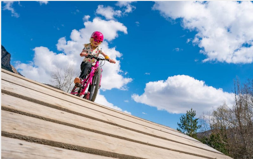
(Rogier Van Rijn)