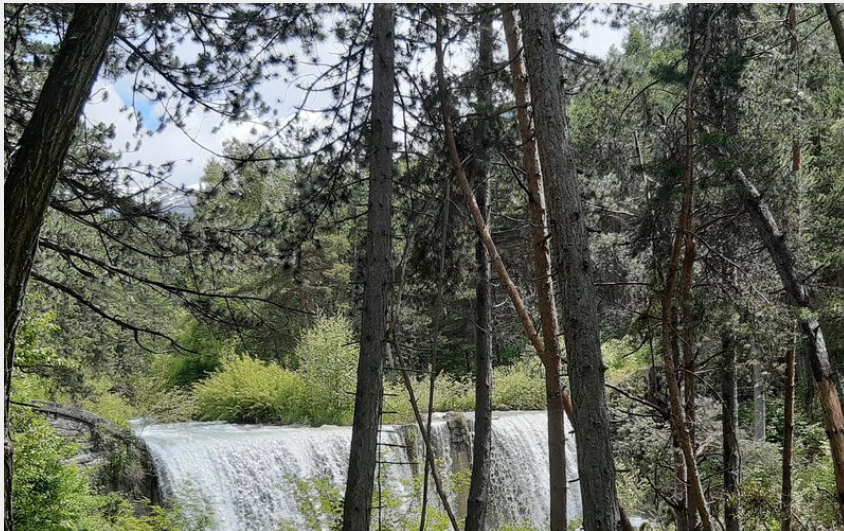
Le torrent des Vachères (florimont.tilliere)