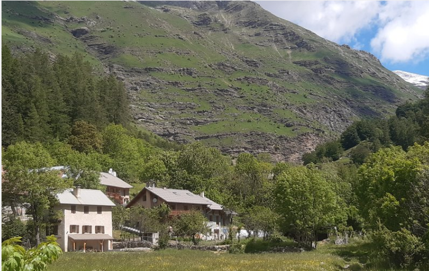
Le hameau des Gourmiers (florimont.tilliere)