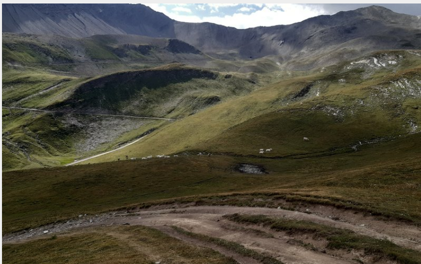
Col du Parpaillon en arrière plan (florimont.tilliere)