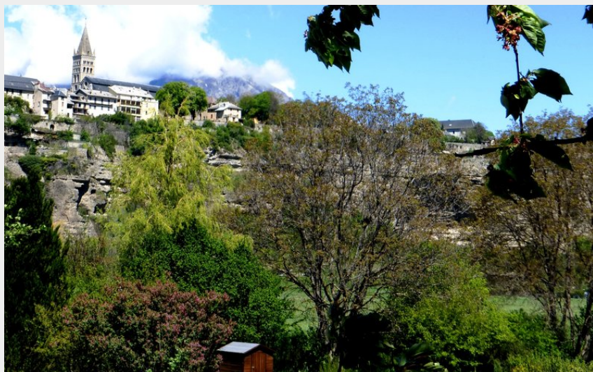
Gros plan sur le Roc (florimont.tilliere)