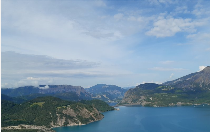
Le barrage de Serre-Ponçon (florimont.tilliere)