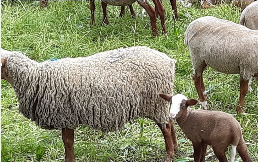
Un agneau près d'une ferme (florimont.tilliere)