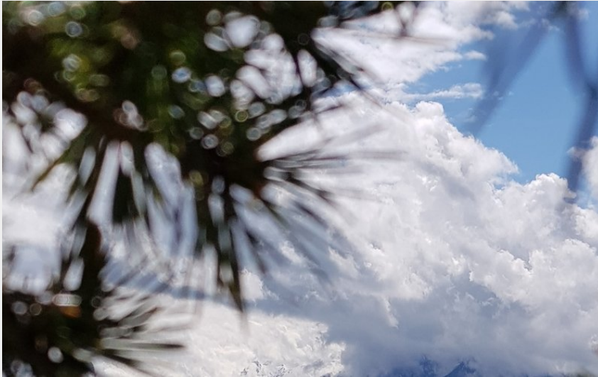
Panorama depuis le Ruban (Peudon Steven)