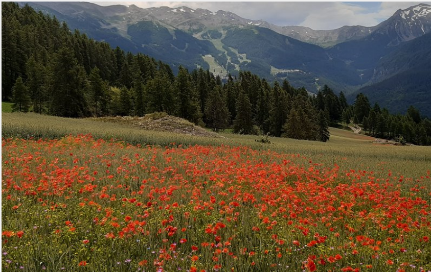
Champ de coquelicots (florimont.tilliere)