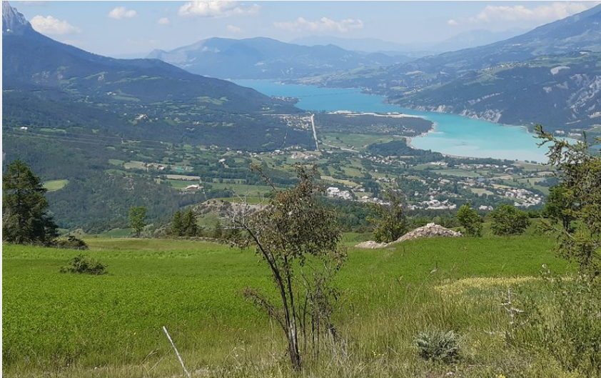
Le lac de Serre-Ponçon