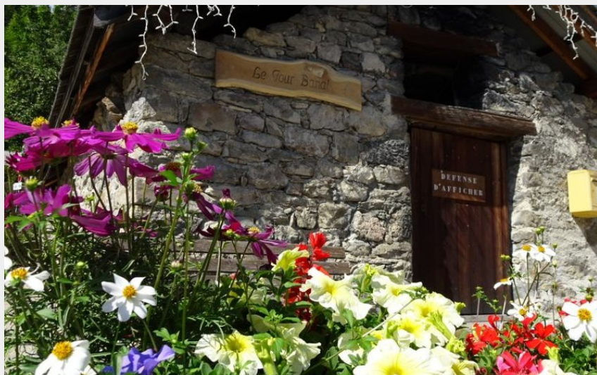
Le four banal