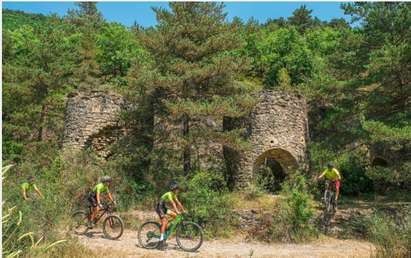
Les fours à calamines dans le ravin des Valettes (Virginie Govignon - OT Larzac et Vallées)