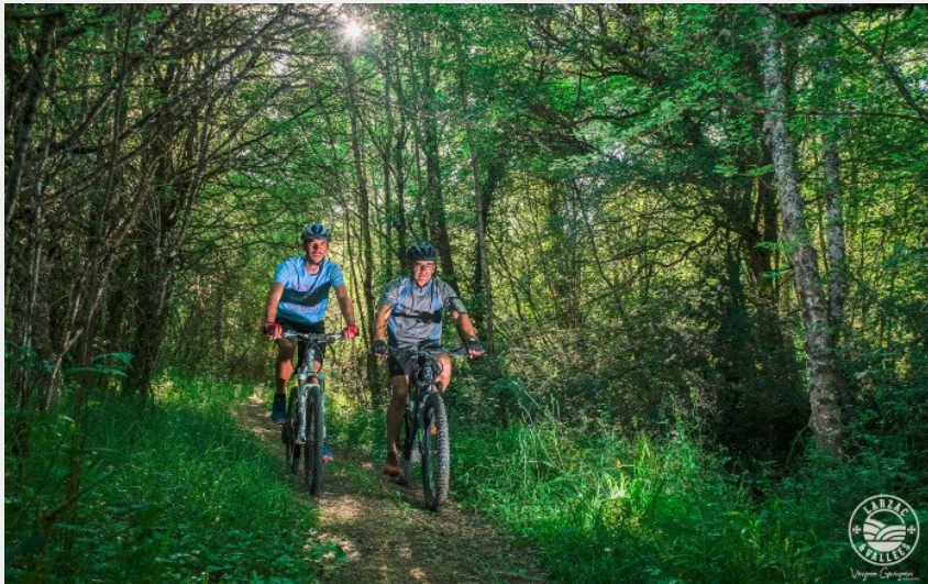
Le long du Durzon...