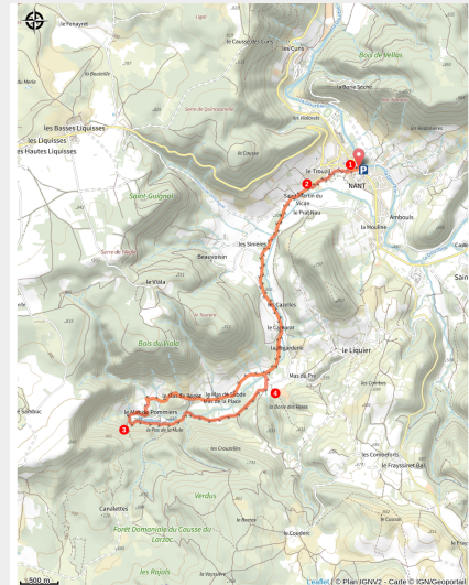
Vers la Source...

Through the small bucolic paths of the “Garden of Aveyron”, this mountain bike loop, accessible to everyone, takes you peacefully to the Durzon spring, punctuated by the murmuring of clear water.