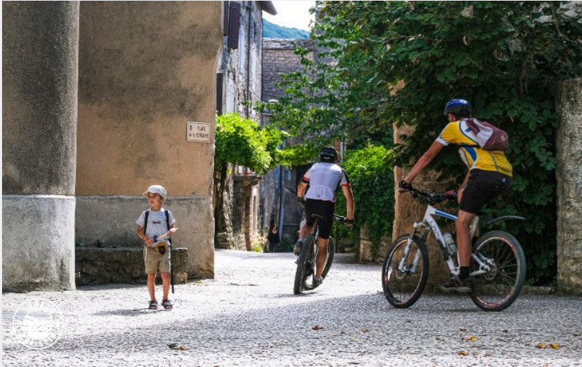
Dans les ruelles de Ste-Eulalie de Cernon