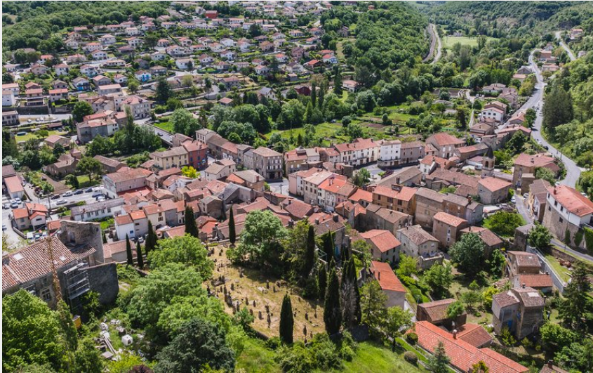
Saint-Rome-de-Cernon (Virginie Govignon)