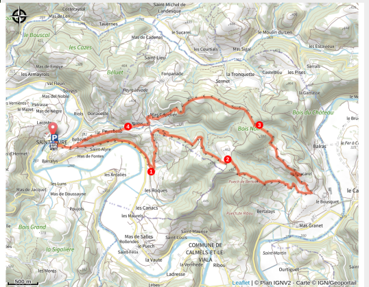
Village de Saint-Izaire