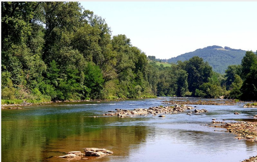
Vue sur le Tarn (Roquefort Tourisme)