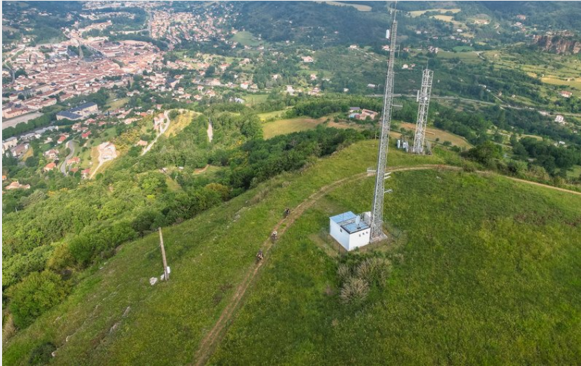
Les relays (Virginie Govignon)