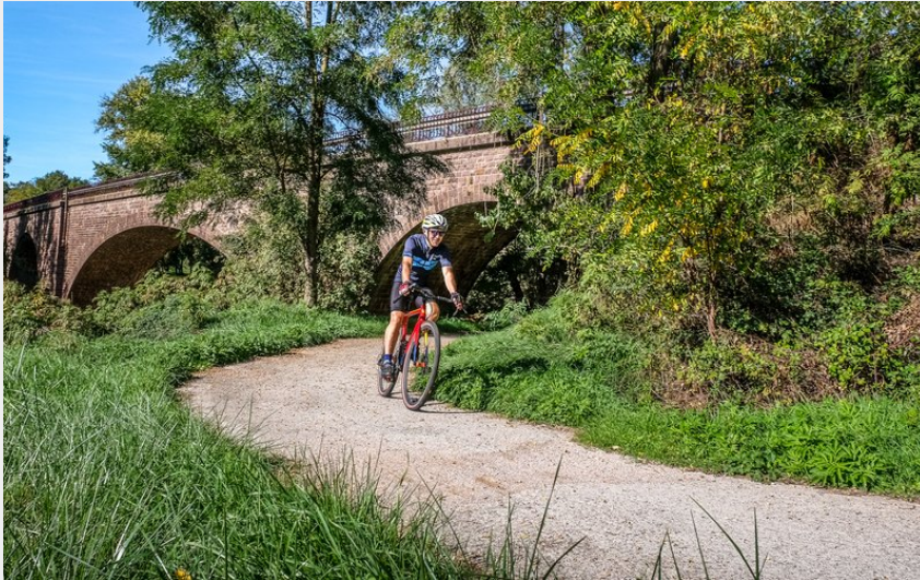
Berges de la Sorgues (Virginie Govignon)