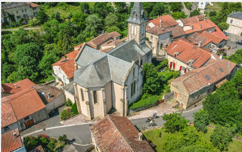
Saint-Jean d'Alcapiès (Virginie Govignon)