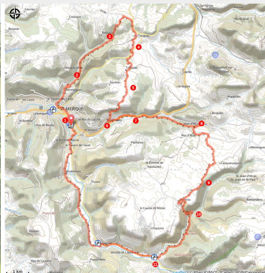
VTT sur piste des Avant Causses (Virginie Govignon)

This very pleasant circuit is the ideal way to explore the avants-causses and the agropastoral heritage: fortified caussenard farms, buissières, lavognes.