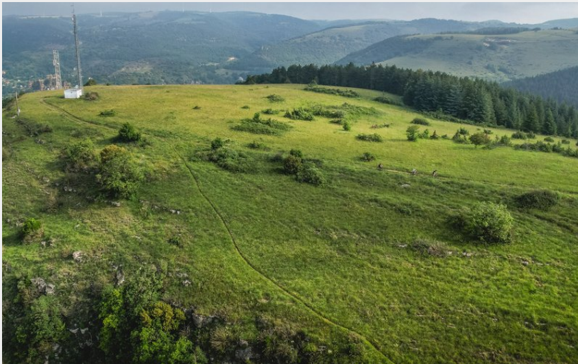
Plateau de la Quille (Virginie Govignon)