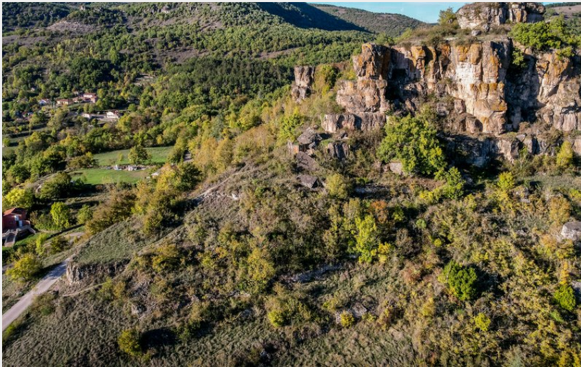
Rocher de Caylus (Virginie Govignon)