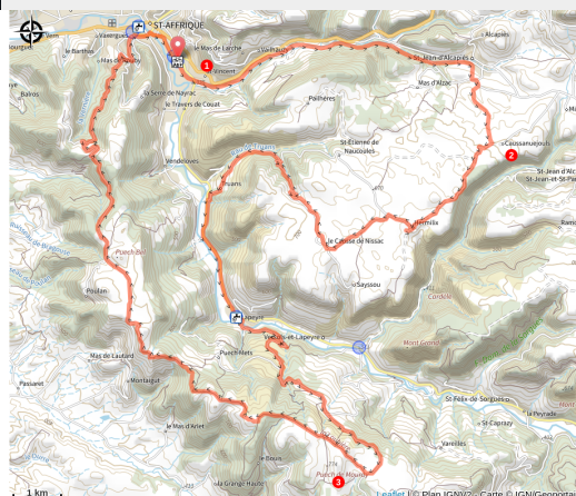
Plateau de la Loubière (CB PNR Grands Causses)

This large loop provides a feeling of change of scene and, in two ascents, carries you from one landscape to another, from the stony scenery of the Causse d’Hermilix to the wine-coloured valleys of the Rougier de Camarès.