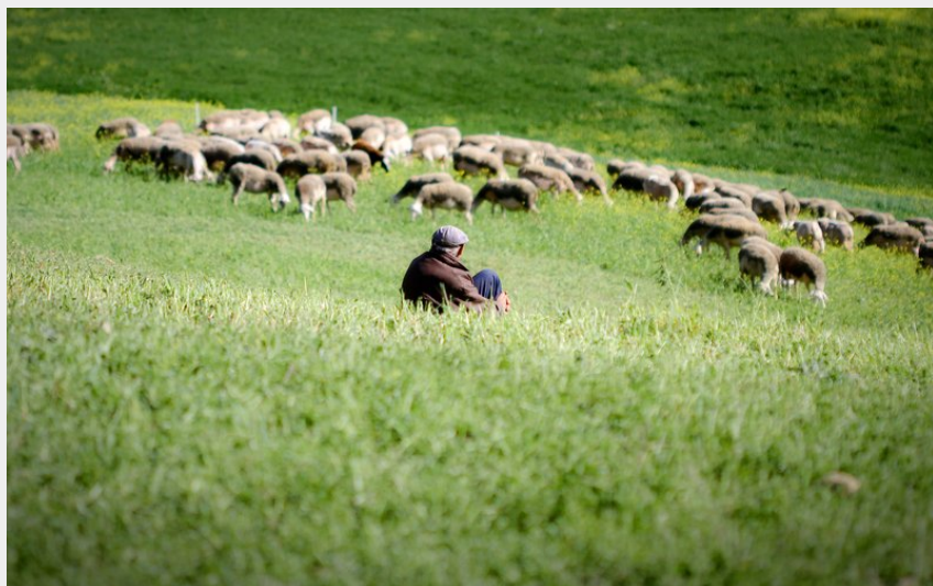
Troupeau de brebis Lacaune (Greg Alric)