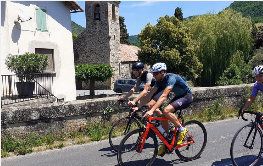
Village de Versols